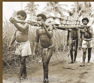
Papua New Guinean natives carry Red Cross blood plasma to front lines to treat wounded soldiers, sailors, and marines.

DECEMBER 31, 1944: The New Guinea Campaign ended.