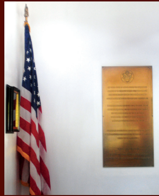
Visitors see the Papua Marker upon entering the U.S. Embassy at Port Moresby.