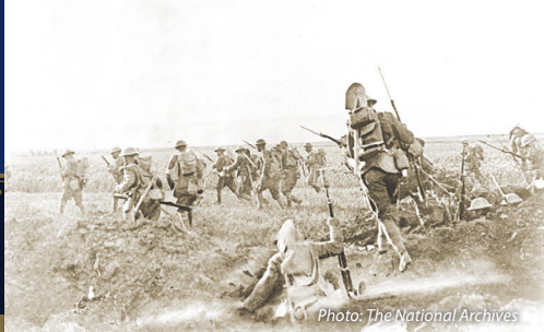
Soldiers of the 1st Division advance to seize and hold Cantigny, May 28, 1918.