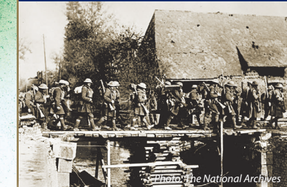
Soldiers of the 27th Division cross a temporary bridge at St. Souplet, Oct. 19, 1918.