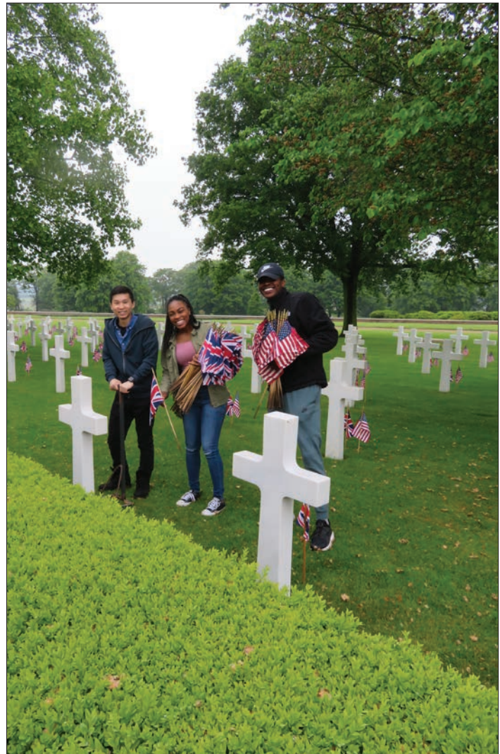
Volunteers from the Air Force Sergeants Association and their families came to Cambridge American Cemetery to place flags in preparation for Memorial Day 2018.

A professional and skilled workforce is achieved and sustained by an organizational commitment to training and professional development. Such a program must position for success an intellectually agile, flexible, and innovative culture that adheres to the highest standards of professionalism and the values of the American Battle Monuments Commission. The agency is on track to meet its goals for training and development.