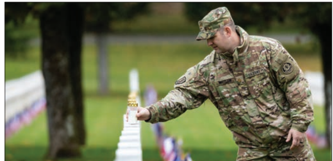
A soldier places a candle on a headstone at Meuse-Argonne American Cemetery for a luminary that coincided with the 100th anniversary of the Meuse-Argonne Offensive.

The agency's strategic goal is to identify, evaluate, document, and preserve ABMC collections, cultural landscapes, archeological features, and historic structures so that the Commission can have better access to its past, inform present and future decisions, and provide physical and intellectual access to its collections to facilitate telling the compelling stories of those who are commemorated at ABMC sites. ABMC will establish an interim collections storage solution, develop a comprehensive strategy for long-term storage, and increase collaboration with professionals of various disciplines. The Commission met all FY 2018 goals for collections and preservation.