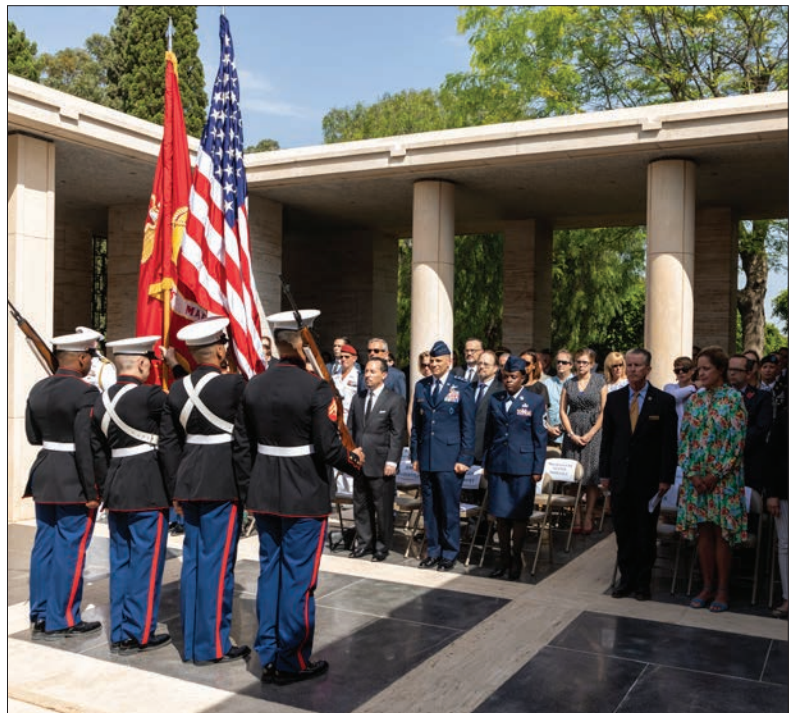
Above: Attendees gathered at North Africa American Cemetery in Tunisia for the 2018 Memorial Day Ceremony.