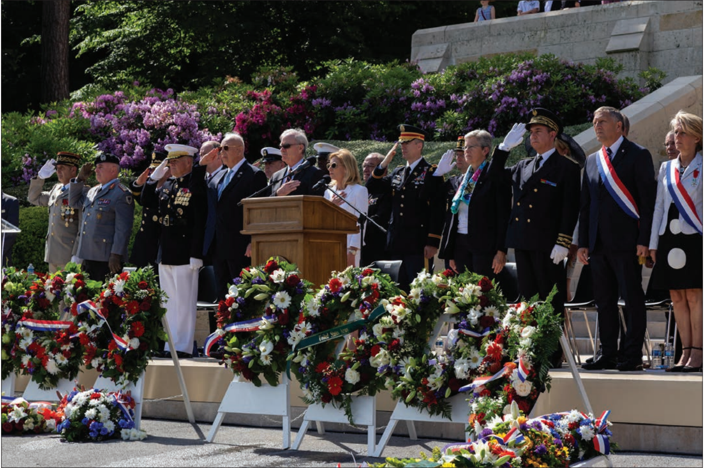
Members of the official party stand during the ceremony at Aisne-Marne American Cemetery to mark the 100th anniversary of the Battle of Belleau Wood and Operations in the Aisne-Marne region.