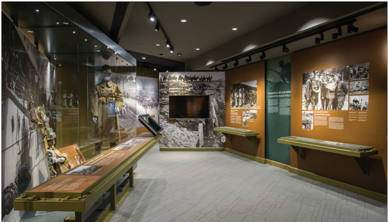
The new visitor center at Chateau-Thierry American Monument was dedicated in May 2018.