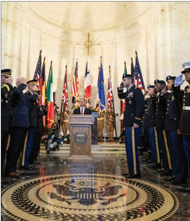
The 100th anniversary of the Meuse-Argonne Offensive was marked with a formal ceremony at Meuse-Argonne American Cemetery in September 2018.

ABMC's strategy is to align the Commission with state-of-the-art knowledge management initiatives by leveraging twenty-first century best practices and technologies to transform our culture, products, services and information into an asset of more value and relevance to the global community. The route to a successful implementation of a Knowledge Management environment requires significant changes in the overall processes and culture of an organization. The Knowledge Management Maturity Model (KMMM) shall analyze the complete scope of key areas of knowledge management, such as organizational environment, culture, technology and strategy. ABMC will develop a KMMM report to define the agency's current position and future direction. We will work towards conducting knowledge audits to identify, quantify and measure knowledge assets within the agency to determine effective processes and systems. The agency continues to work towards achieving its goals for Knowledge Management.